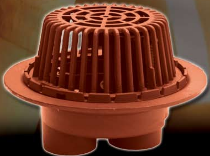
3046 Dual Outlet Roof & Overflow Drain