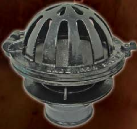
Roof Drain Circa 1930