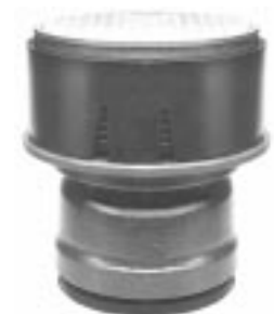
6000Z - Page 7-6