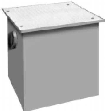
5600 - Page 6-13