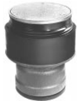
6000 - Page 7-5