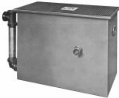
5400 - Page 6-11