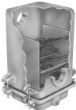
5730 - Page 6-14