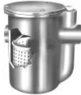
5740 - Page 6-15