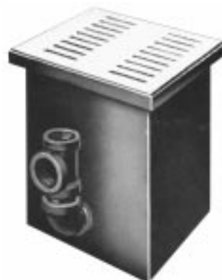
5800 - Page 6-19