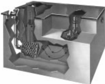
5500 - Page 6-12