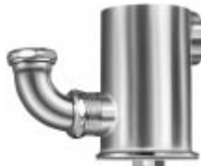
5750SO - Page 6-17