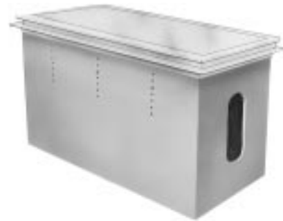
5100FHT - Page 6-5 Housing Only