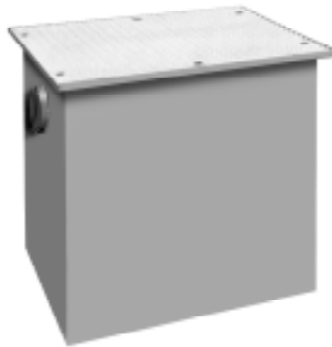
5100XT - Page 6-2