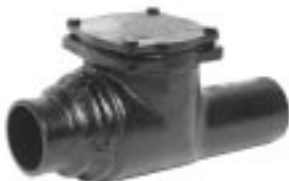
4200 - Page 5-1