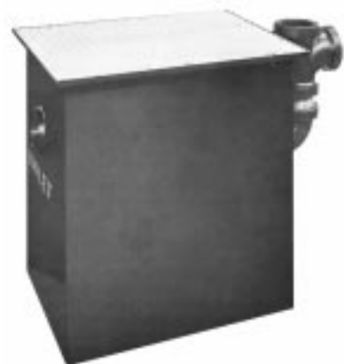
5200 - Page 6-7