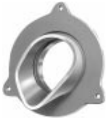
3940 - Page 4-31