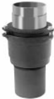
3900NH - Page 4-30