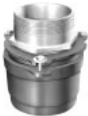
3900 - Page 4-29