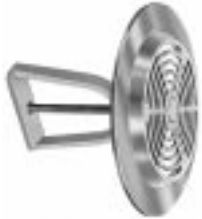
3880P - Page 4-28