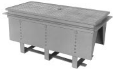
5100FH - Page 6-4 Housing Only