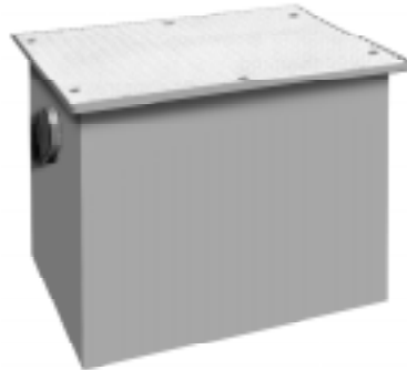
5100 - Page 6-1