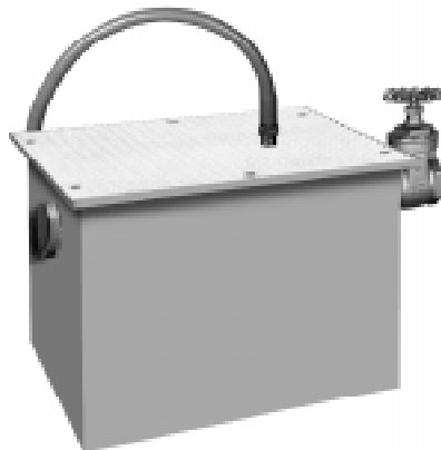
5100JCX - Page 6-3